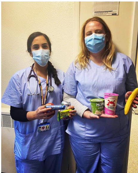
NHS STAFF AT QEQM enjoyed the snack bags

TDC Helpline: 01843 577330 Our Kitchen: 07912 793980 Age UK: 01843 223881 Asthma UK: 0300 222 5800 British Heart Foundation: 0300 330 3311 Diabetes UK: 0345 123 2399 Mind: 0300 123 3393 Scope: 0808 800 3333 Silver Line: 0800 470 8090